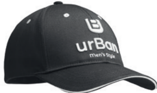
MH2103 MH2103 Recycled PET fabric Cap heavy cotton with sandwich.