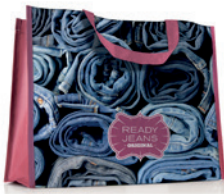
MO4070 Horizontal shopping bag with long self material or PP webbing handles.