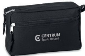
Better & Smart MO6155 Cosmetic bag with double zipper. 600D RPET.