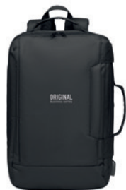
Singapore MO6329 Computer backpack in 300D RPET Polyester with padded shoulder strap including one main internal compartment for 16 inch laptop and a USB charging cable.