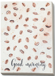
NOPCC5 A5 notebook with soft cover made of recycled paper containing coffee waste.