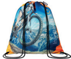
MB3111 RPET Drawstring bag