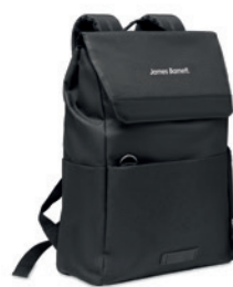
Daegu Lap MO6464 600D 2 tone RPET 15 inch laptop backpack with magnetic snap button. Padded laptop compartment, front zippered pockets and 2 side pockets.