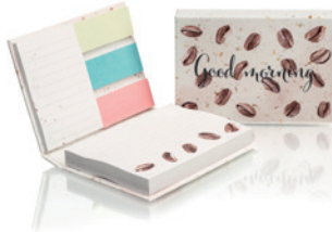
COMBC1 COMBC1 Coffee paper hard cover ComboNote.