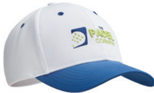
MH2101 MH2101 Recycled PET fabric Cap.