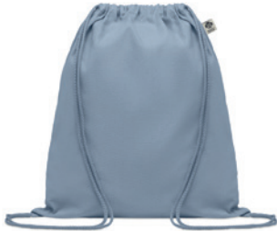
Yuki Colour MO6355

Organic cotton medium food storage bag. 140 gr/m².