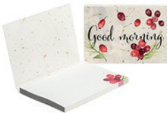
SNCS50 Soft cover made of recycled paper containing coffee waste (size 100x72mm, closed) with 50 sticky notes of recycled paper (80gsm) and recycled offset paper bottom sheet (160gsm).