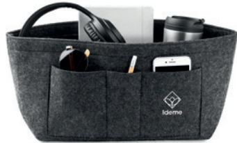
Nizer MO6334 RPET felt travel organizer with 2 inner and 4 outer compartments.