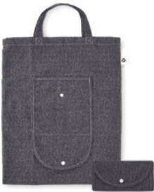
Duofold MO6549 Foldable 2 tone recycled cotton and recycled polyester shopping bag with long handles. Approx. 140 gr/m². This item can shrink after printing.