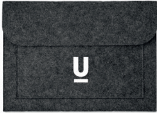
Pouchlo MO9818 Documents bag or 15 inch laptop pouch in RPET felt, 2mm thick, with front pocket and hook and loop closing.