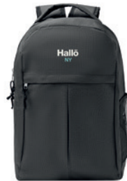
Siena MO6515 Backpack in 600D RPET 2 tone polyester with outside pocket with zipper and mesh pocket on the side.