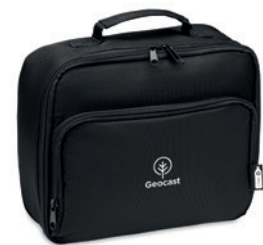
Icicle MO6285 Insulated lunch/ cooler bag in 600D RPET with carry handle. 2mm aluminium foil lining.