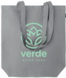
Naima Tote MO6162 100% hemp fabric shopping bag with long handles with gusset in the bottom. 200 gr/m².