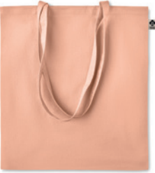
Zimde Colour MO6189

Certified organic cotton shopping bag with long handles. A classic tote bag design made to carry your daily groceries or other items. Carry the bag in your hands or over your shoulder with the long handles. Made from 100% natural organic cotton 140 gr/m².