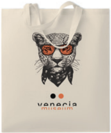
Marketa + MO9847 Cotton shopping bag with short handles. 140gr/m². Produced under a certified standard for the use of harmful substances in textile.