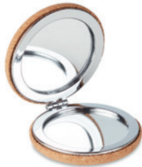
Guapa Cork MO9799 Rounded double sided compact mirror with cork finish cover. Cork is a natural material, due to its structural nature and surface porosity the final print result per item may have deviations.