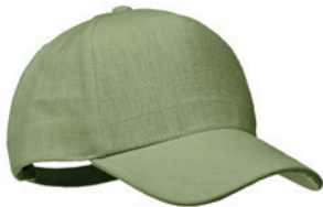
Naima Cap MO6176 5 panel baseball cap in 100% hemp fabric 370 gr/m² with brass clips on adjustable strap closure. 5 stitched eyelets in matching colour. Size 7 1/4.