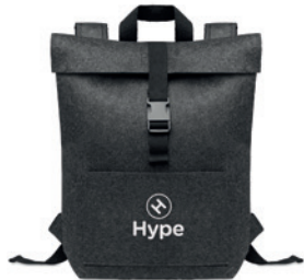
Indico Pack MO6456 RPET felt backpack with cotton strap closure and zippered pocket on the front. It has a laptop compartment.