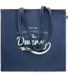
Style Tote MO6420 50% Recycled cotton dye denim and 50% cotton shopping bag with long handles. 250 gr/m².