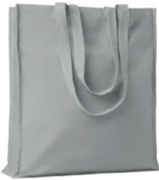
Portobello MO9596 Cotton shopping bag with long handles and gusset. 140 gr/m². Produced under a certified standard for the use of harmful substances in textile.