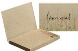
SNGG50 SNGG50 Grass paper soft cover with grass paper sticky notes.