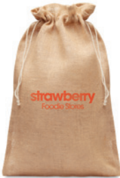
Jute Large MO9930

Large gift jute draw cord bag. Size approx. 30 x 47cm.