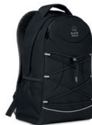
Monte Lomo MO6156 Backpack in 600D RPET with dark cords in front and reflective front panel feature. Mesh pockets on both sides.