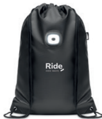
Urbancord MO9970 Drawstring bag in 420D RPET with detachable COB light on the front. COB light in white and red colour. Button cell battery included