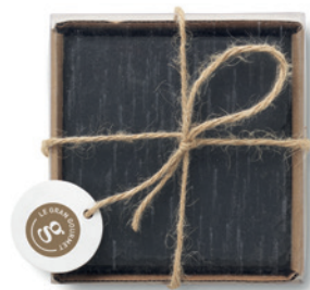
Slate4 MO9124 Set of 4 coasters made of slate with EVA bottom.