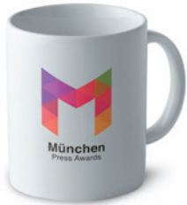
Dublin KC7062 Classic cylindrical ceramic mug of 300 ml mug. Individual packaging in corrugated carton gift box. For full colour process printing, please contact us for pricing.