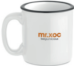
Tweenies MO9243 Ceramic vintage style mug of 240 ml capacity. Individual packaging in white carton box. Ceramic transfer is dishwasher safe.