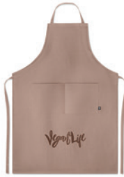
Naima Apron MO6164 Adjustable kitchen apron with 2 front pockets in 100% hemp fabric. 200 gr/m².