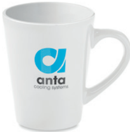
Taza MO8831 Ceramic mug of 180 ml capacity. Individual packing in white cartoon box. Pad printing is not dishwasher safe. Ceramic transfer is dishwasher safe.