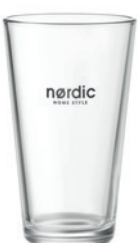
Rongo MO6429 Re-usable Conic glass. Capacity: 300 ml.