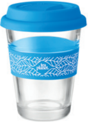
Astoglass MO9992 Glass tumbler with silicone lid and grip. Capacity 350 ml. As this is a single wall mug heat transfer can still occur.