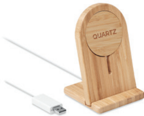
Hintois MO6369 Magnetic bamboo wireless charger with stand. Output: DC 9V/1.1A (10W). Compatible with iPhone® 12 and newer. Including additional magnetic metal ring to support charging of other non-magnetic wireless chargeable phones.