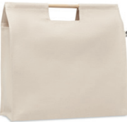
Mercado Top MO6458

Certified organic cotton shopping bag with long handles. A classic tote bag design made to carry your daily groceries or other items. Carry the bag in your hands or over your shoulder with the long handles. Made from 100% natural organic cotton 140 gr/m².