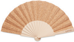
Fanny Cork MO6232 Manual fan in wood with cork fabric sheeting.