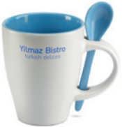
Dual MO7344 Bicolour ceramic coffee mug of 250 ml capacity with colour matching spoon. Individual box 11,5x10,5x9,3cm.