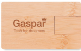
Creditcard Plus MO1203 16GB USB Flash Drive with protective bamboo cover. Bamboo is a natural product, there may be slight variations in colour and size per item, which can affect the final decoration outcome.