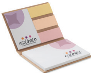
COMBE1 COMBE1 Recycled Hard cover ComboNote (106x77mm, closed) with recycled sticky notes (80gsm) of 100x72mm and 50x72mm; and recycled markers in 3 different colours.