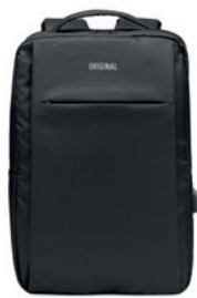
Seoul MO6328 Computer backpack in 300D RPET Polyester with padded shoulder strap including one main internal compartment for 16 inch laptop and a USB charging cable.