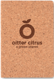
Notecork MO9860 A5 notebook with soft cork cover. Casebound. 192 lined recycd paper pages (96 sheets). Cork is 100% natural material. Due to its structural nature and surface porosity the final print result per item may have deviations.