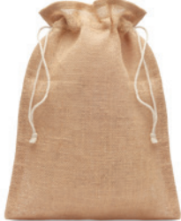
Jute Medium MO9929

Large gift jute draw cord bag. Size approx. 30 x 47cm.