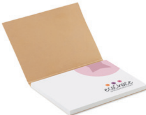
SNES50 SNES50 Recycled soft cover sticky note (size 100x72mm, closed) with 50 sticky notes of recycled white paper (80gsm).