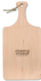
Ellwood Lux MO9624 Cutting board with handle and cord hanger, manufactured in EU Alder wood.