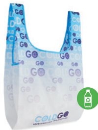
MB1111 Foldable vest shopping bag in 100% RPET with inside pocket. Size: 41x63 cm.