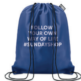
Shooppet MO9440 Drawstring bag in 190T RPET with PP strings. Eco-friendly material made from recycled plastic bottles. Sublimation print available on white item only.