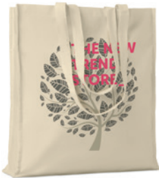
Portobello MO9595 Cotton shopping bag with long handles and gussets. 140 gr/m². Produced under a certified standard for the use of harmful substances in textile.