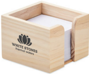
Sequoia MO6482 Bamboo memo cube dispenser with white plain sheets memo block. 600 white plain sheets (70 gsm / 9x9 cm).