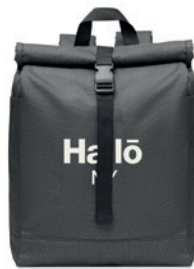
Udine MO6516 Backpack in 600D RPET 2 tone polyester with roll top closure.