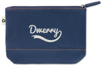
Style Pouch MO6421 50% Recycled cotton dye denim and 50% cotton cosmetic pouch with zipper. 250 gr/m².