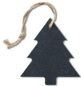
Slatetree CX1433 Slate hanger tree shaped with cord hanger.