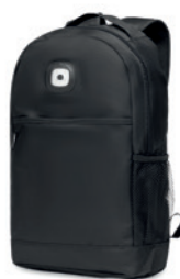
Urbanback MO9969 Backpack in 600D RPET with detachable COB light on the front panel. COB light in white colour with 3 different light brightness setting. Front pocket with Velcro closure. Mesh pocket on the side. Button cell battery included.