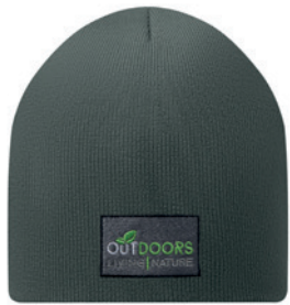
MW1101 MW1101 Double layer beanie. 50% rPET + 50% acrylic, 55 grams.