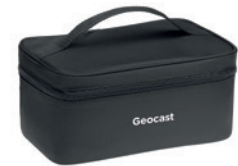
Growler MO6286 Insulated cooler bag in 600D RPET includes a reusable PP 1900ml capacity lunch box. 2mm aluminium foil.