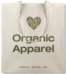
Organic Cottonel MO8973

Organic cotton shopping bag with long handles. 105 gr/m². Made from organic cotton produced under a certified label.