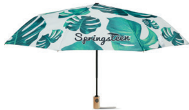
MU2006 MU2006 3 fold, 21 inch (dia. 95cm) umbrella with wooden handle. Black plated shaft, fiberglass ribs. Automatic opening and closure.