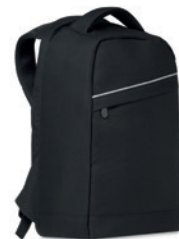
Munich MO6157 600D RPET backpack with padded shoulder strap with main internal compartment. It has a zippered front pocket. Includes one internal 13 inch laptop compartment. Zipper main compartment on backside for better security.