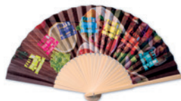
MPFN03 MPFN03 Full colour printing on one side included. Manual hand fan in bamboo with 80gsm paper fabric sheet.