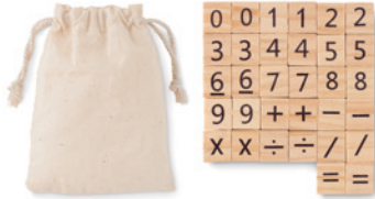
Educount MO6398 Wood educational counting game in cotton pouch. Includes 32 pieces.