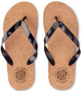
Bombai L MO6403 Beach slippers with cork and EVA sole and PVC straps. Size L fits 40-43.