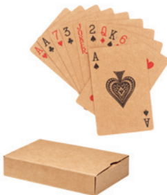
Aruba + MO6201 Recycled paper classic playing cards in a paper box. 54 cards.