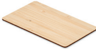
Custos + MO6200 RFID Anti-skimming card in bamboo case. By using an electromagnetic field it makes all 13.56 MHz cards (trains, buses, bank or credit cards) secure from electronic pick pocketing 2-3 cm around the card. (1,3 mm).