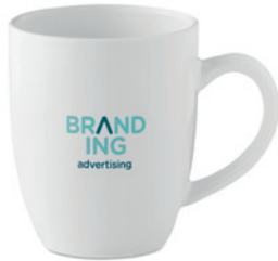
Trent KC7063 Ceramic mug of 300 ml capacity. Presented in an individual corrugated carton gift box.