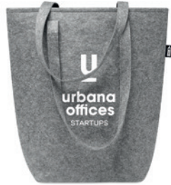
Taslo MO6185 RPET felt shopping bag with long handles and bottom gussets.