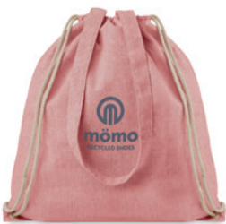
Moira Duo MO9603 2 tone recycled cotton and recycled polyester shopping bag with drawstring and long handles. Approx. 140 gr/m². This item can shrink after printing.