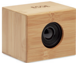
Yista MO6475 5.0 wireless speaker in Bamboo and 10W wireless charger. Connect device to your computer, place smartphone on it to commence charging. 1 Rechargeable Li-Ion 2000 mAh battery. Output data: 3W, 4 Ohm. Playing time approx. 4h.