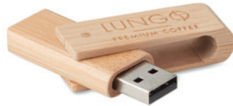
MO1202i MO1202i Rotating Bamboo casing USB flash drive. Ideal for laser engraving. As natural materials are used, the colour per item and the outcome of the laser engraving can vary.