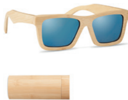
Wanaka MO6454 Full bamboo sunglasses with coloured mirrored lenses presented in a bamboo case. UV400 protection.