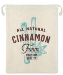
Veggie MO9865 Re-usable food bag. One side is in cotton (140gr/m²) and other one is in mesh cotton (110gr/m²). Drawstring closure. Produced under a certified standard for the use of harmful substances in textile.