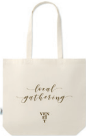
Zigzag MO9750 Foldable shopping bag in recycled fabrics 150 gr/m². 55% RPET and 45% cotton. The bag Includes a zipper allowing it be neatly folded.made from recycled fabrics produced under a certified label.