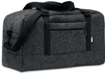
Indico Bag MO6457 RPET felt sports/fitness or weekend bag with zippered front pocket, canvas handles and detachable adjustable shoulder strap.