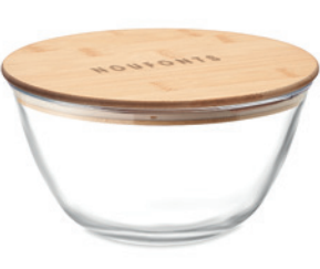
Salabam MO6314 Salad/storage box in borosilicate glass with bamboo lid and silicone band. Capacity: 1200 ml.