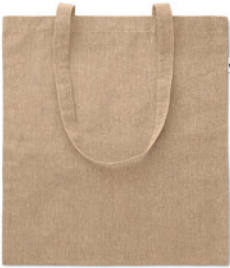
Cottonel Duo MO9424 2 tone recycled cotton and recycled polyester shopping bag with long handles. Approx. 140 gr/m². This item can shrink after printing.