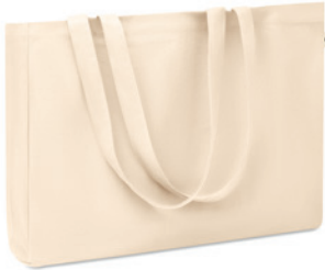
Respect MO6379 Recycled canvas shopping bag or beach bag, 50% cotton and 50% recycled cotton with long handles and gusset. 280 gr/m².