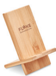
Whippy MO9944 Bamboo phone stand holder. It includes 2 parts, you can assemble it vertically to hold your phone. Bamboo is a natural product, there may be slight variations in colour and size per item, which can affect the final decoration outcome.