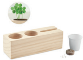
Thila MO6408 Wooden desk stand with pen and phone holder and clover seeds.