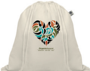
Organic Hundred MO8974

Organic cotton drawstring bag. 140 gr/m². Made from certified organic cotton.