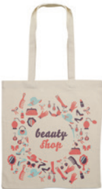
Cottonel + MO9267 Cotton shopping bag with long handles. 140 gr/m². Produced under a certified standard for the use of harmful substances in textile.