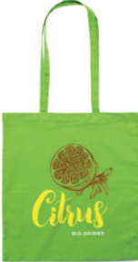
Cottonel Colour + MO9268 Cotton shopping bag with long handles. 140 gr/m². Produced under a certified standard for the use of harmful substances in textile.