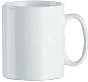
Whitie KC8040 Classic cylindrical ceramic mug of 300 ml mug. Individual packaging in corrugated carton gift box.