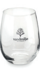
Bless MO6158 Reusable stemless glass presented in gift box. Capacity: 420 ml.