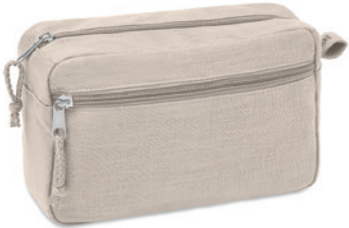
Naima Cosmetic MO6165 Cosmetic bag with double zipper. 100% hemp fabric. 200 gr/m².