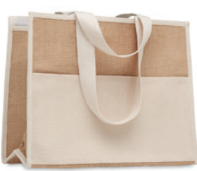
Campo De Geli MO6160

Jute shopping and cooler bag with long handles, laminated and with hook and loop closure, front with canvas pocket and cotton webbing.