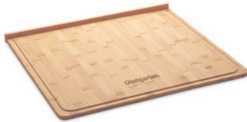
Kea Board MO6488 Large bamboo cutting board with groove.