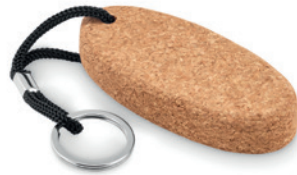
Boat MO6161 Oval floating cork key ring with braided rope.