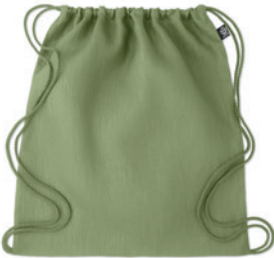
Naima Bag MO6163 Drawstring bag in 100% hemp fabric. 200 gr/m².