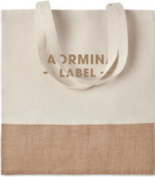
India Tote MO9518

Jute shopping and cooler bag with long handles, laminated and with hook and loop closure, front with canvas pocket and cotton webbing.