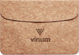
Grace MO6448 Cork 14 inch laptop bag with magnetic closure flap.