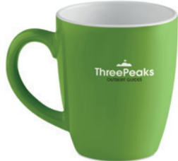
Colour Trent MO9242 Ceramic coloured mug of 290 ml capacity. Presented in an individual corrugated carton gift box.