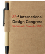
Cartopad MO7626 Recycled paper notebook with matching pen. Soft paper cover with pen holder. Casebound. 160 lined pages (80 sheets). Matching push button ball pen in recycled carton and biodegradable plastic. Blue ink.