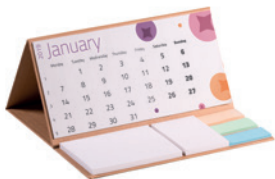
CALECO CALECO Recycled CalendoNote hard cover.