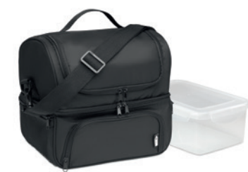
Iceberg MO6287 Insulated cooler bag in 600D RPET includes a reusable PP 1900ml capacity lunch box. With 2 sections to store hot and cold food separately. Adjustable and detachable shoulder strap. 2mm aluminium foil lining.