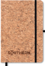
Suber MO9623 A5 notebook with hard cork cover. Casebound. 192 lined paper (96 sheets). Elastic closure strap, ribbon bookmark and elastic pen holder. Cork is 100% natural material. Due to its structural nature and surface porosity the final print result per item may have deviations.