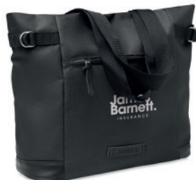
Daegu Bag MO6466 600D 2 tone RPET shopping bag with zippered front and inside pocket with magnetic button closure.