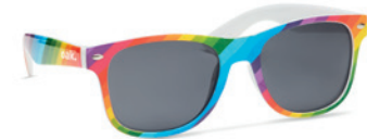
MPSG04 MPSG04 Fully customised PC Sunglasses