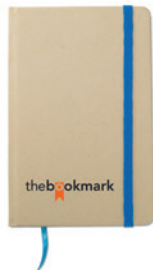
Evernote MO7431 A6 recycled paper hard cover notebook. Casebound. 192 plain pages (96 sheets). Elastic closure strap.