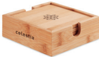
Mendi MO9683 Set of 4 coasters made of bamboo. Presented in a bamboo holder. Bamboo is a natural product, there may be slight variations in colour and size per item, which can affect the final decoration outcome.