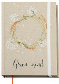
NOTE5 NOTE5 Hard cover A5 notebook with hard cover made of recycled paper containing graas fibers.