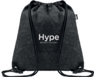
Indico MO6463 RPET felt drawstring bag with polyester cords.