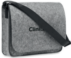
Baglo MO6186 RPET felt messenger or laptop bag with hook and loop closure. Fits a 15 inch laptop.