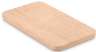
Petit Ellwood MO8860 Small cutting board manufactured in EU from Alder wood. Made from 1 piece of wood, 100% natural.