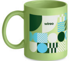
Dublin Tone MO6208 Classic ceramic coloured mug in box. Capacity 300 ml.