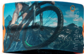
MH3101 MH3101 Full colour RPET headband