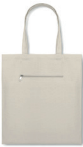
Rassa MO6159 Canvas shopping bag with long handles and with bottom gusset. An ideal bag for your daily grocery shopping. The long handles make it easy to carry it by either holding it or hanging it over your shoulder. This canvas tote has a base gusset so you can carry more items than with a regular shaped bag. 270 gr/m². Produced under a certified standard for the use of harmful substances in textile.