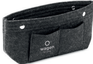
Nazer MO6335 RPET felt travel organizer with 5 inner and 3 outer compartments.