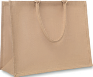
Brick Lane MO8965

Jute laminated shopping or beach bag with cotton handle. Short handles.