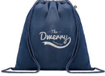
Style Bag MO6422 50% Recycled cotton dye denim and 50% cotton drawstring bag. 250 gr/m².